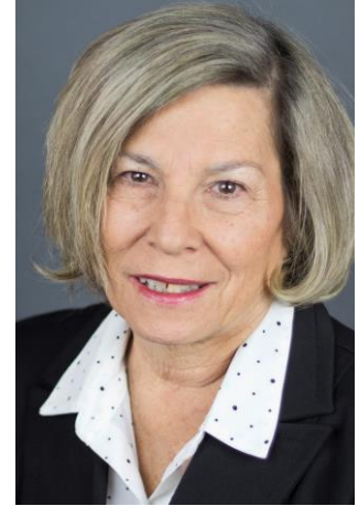
Pepe Eads Zonta Club of Antelope Valley