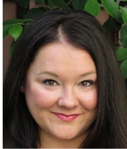
Brit Vaughn Zonta Club of Burbank Area