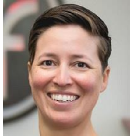
Rosa Coletto Zonta Club of Newport Harbor